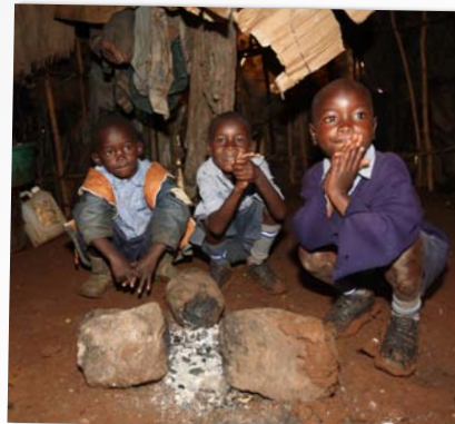
A COLD FIRE