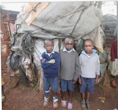
SLUM CHILDREN'S HOME

turning of the calendar page, I hear the call fresh and clear: Go! Preach! Teach! Baptize! Feed and care for the needy! The only commodity that truly matters in mission work is time. Money is vital. Prayer is essential. Plans and preparation are